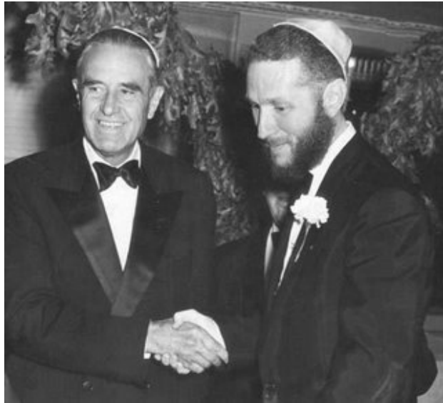
Governor William Averell Harriman